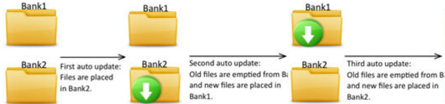
Figure 4-1. ACC Auto-Update Flow